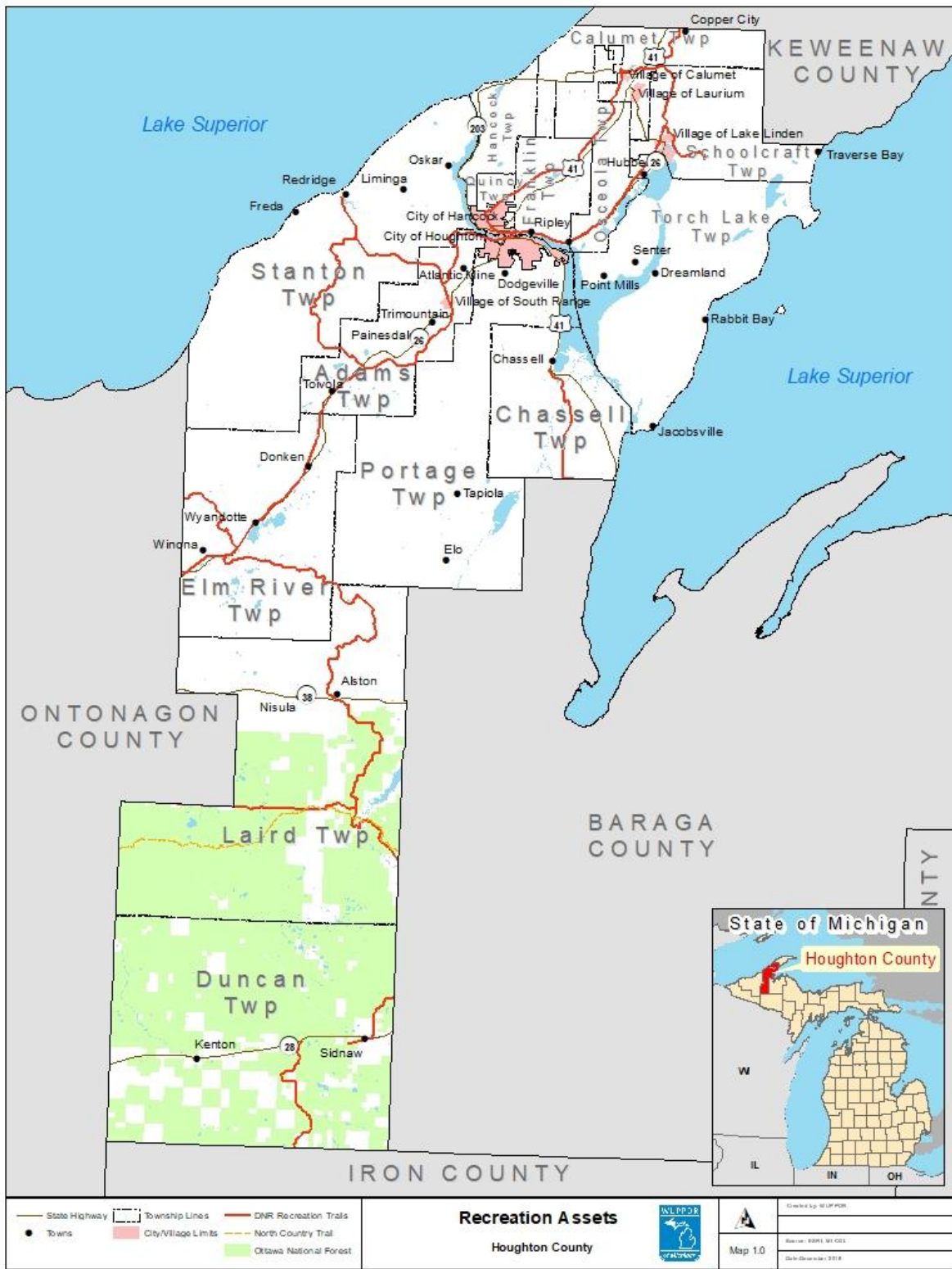
Figure 1: Regional recreation facilities