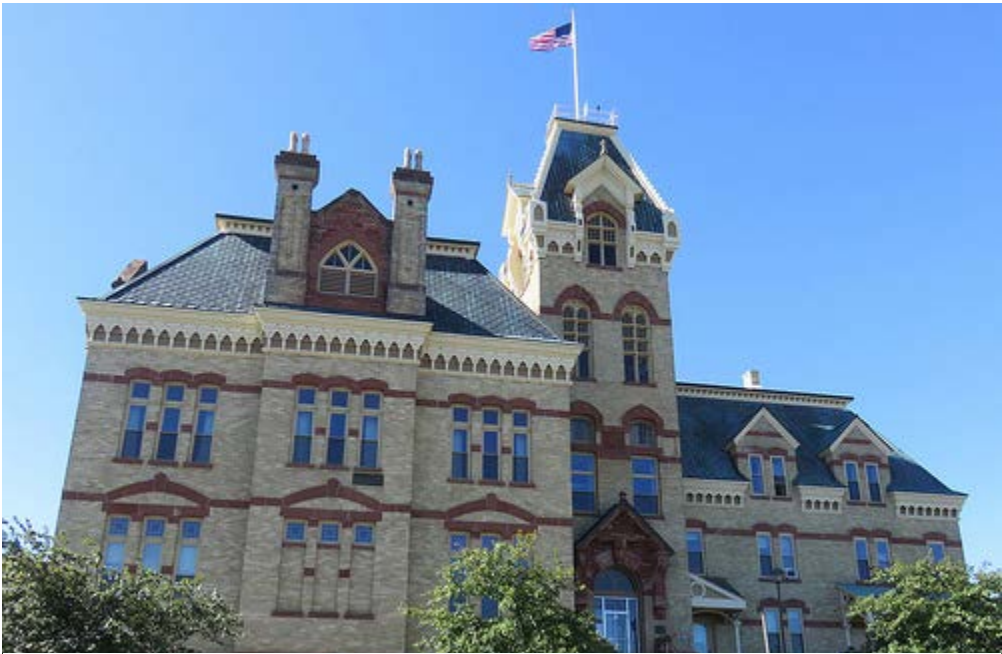
Houghton County Courthouse

The county’s population is concentrated in the northern half of the county. This includes two primary population centers, 1) the Cities of Houghton and Hancock, opposite each other on Portage Lake/Canal near the center of the county, and 2) the Villages of Calumet and Laurium in the northern tier of the county. The City of Houghton is the County seat.